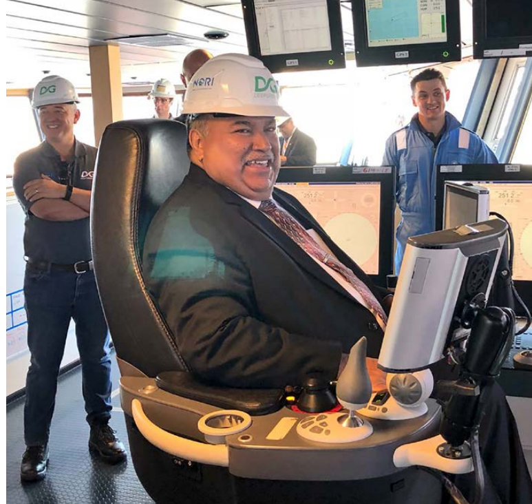
Photo: Nauru President Baron Waqa dons a DeepGreen hard hat to celebrate the launch of the NORI exploration vessel in San Diego, April 2018.

Nauru is a small nation consisting of one island and a population of around 13,000 people. Nauru's colonial-era history of terrestrial mining has been described as